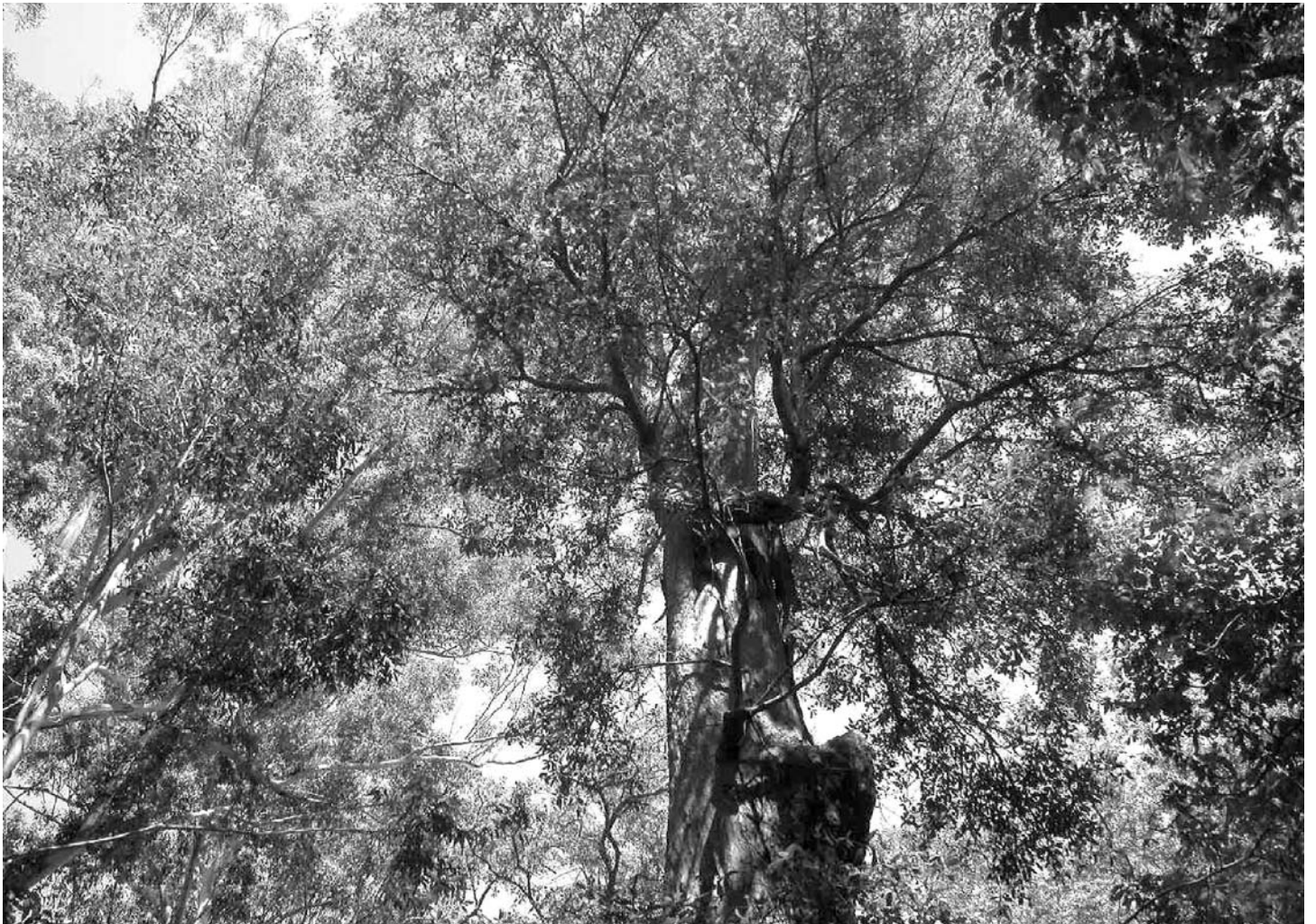
One of the original trees in Bulbararing Reserve dating from before European settlement