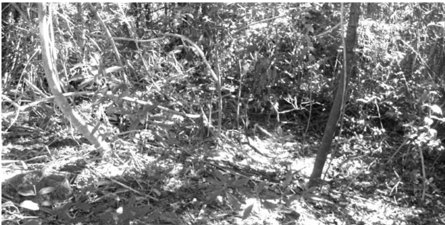
Willdenow Road view