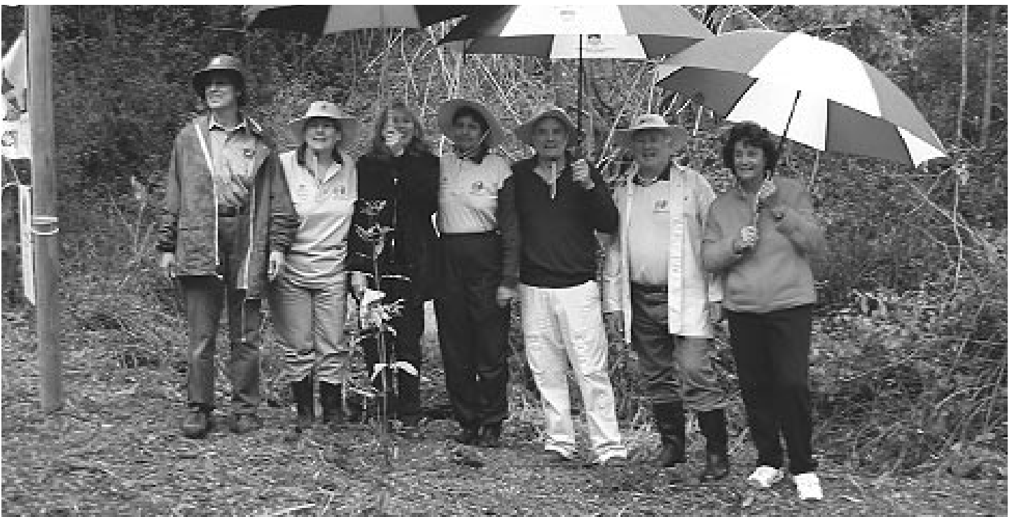
Tree planting ceremony 26/7/04 to celebrate the new grants

If you wish to attend the Open Day and BBQ lunch, please RSVP (for catering purposes and with any requests for vegetarian options) to Carol Gumley, Bushcare Convenor, on 4381 0175, by 12 noon Friday 10 September. Hope to see you there!